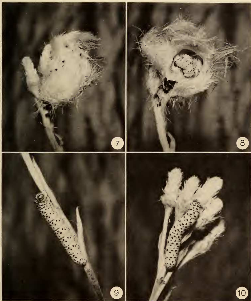
FIGS. 7-10. Schinia verna , n. sp., on Antennaria neodioica Greene; 7 , molting nest of fourth stadium larva; 8 , same, opened to show larva; 9 , ultimate stadium larva, lateral; 10 , same, dorsal.

molt, they form a very definite nest of floral parts (Figs. 7, 8) in which they can remain quiescent until moulting is completed.